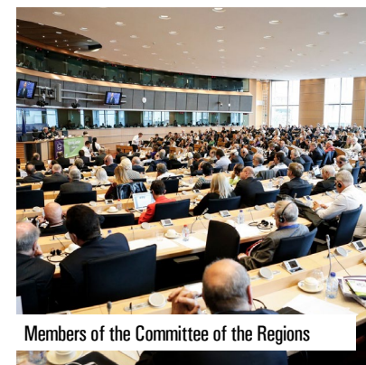
Members of the Committee of the Regions