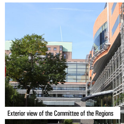
Exterior view of the Committee of the Regions

7:00-10:00 p.m. Official Dinner with addresses of the participating towns and theatre presentation by "Stolperdraht" Schwedt/Oder in the Thon Hotel EU