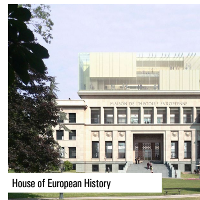
House of European History

8:00-10:00 p.m. Flying dinner/socialising