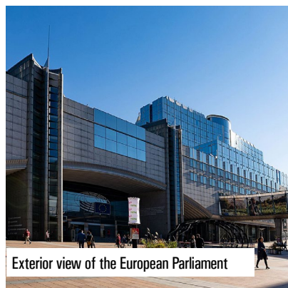
Exterior view of the European Parliament