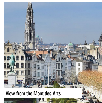
View from the Mont des Arts